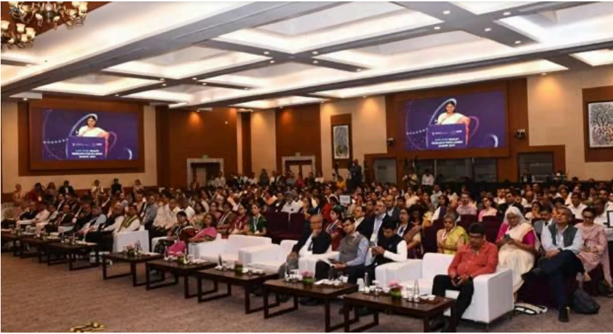
India Poised for Global Leadership in Health Research as ICMR Marks 113 Years of Transformative Progress

The event celebrated outstanding contributions to medical research by recognizing exceptional researchers, teams, and institutions. Awards were presented in various categories, including Best Research Paper, Best Innovation, Best Team Research, Best Ph.D. Student, and institutional honors for excellence in multidisciplinary research, rural health, diagnostics, and health technology assessments. These accolades underscored the pivotal role of research excellence in shaping India's healthcare future.