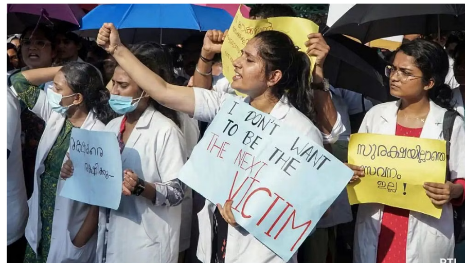
Doctors, medical students raise slogans during their protest against the killing of a female doctor

A woman doctor on duty at a government hospital in Kerala's Kollam district was stabbed to death on Wednesday by a school teacher who was brought to the facility for a medical examination by the Police.