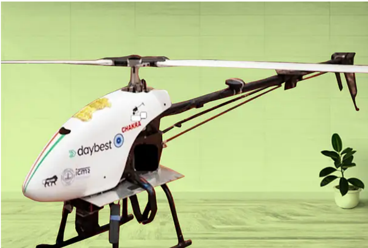
ICMR's i-Drone (Representative image)