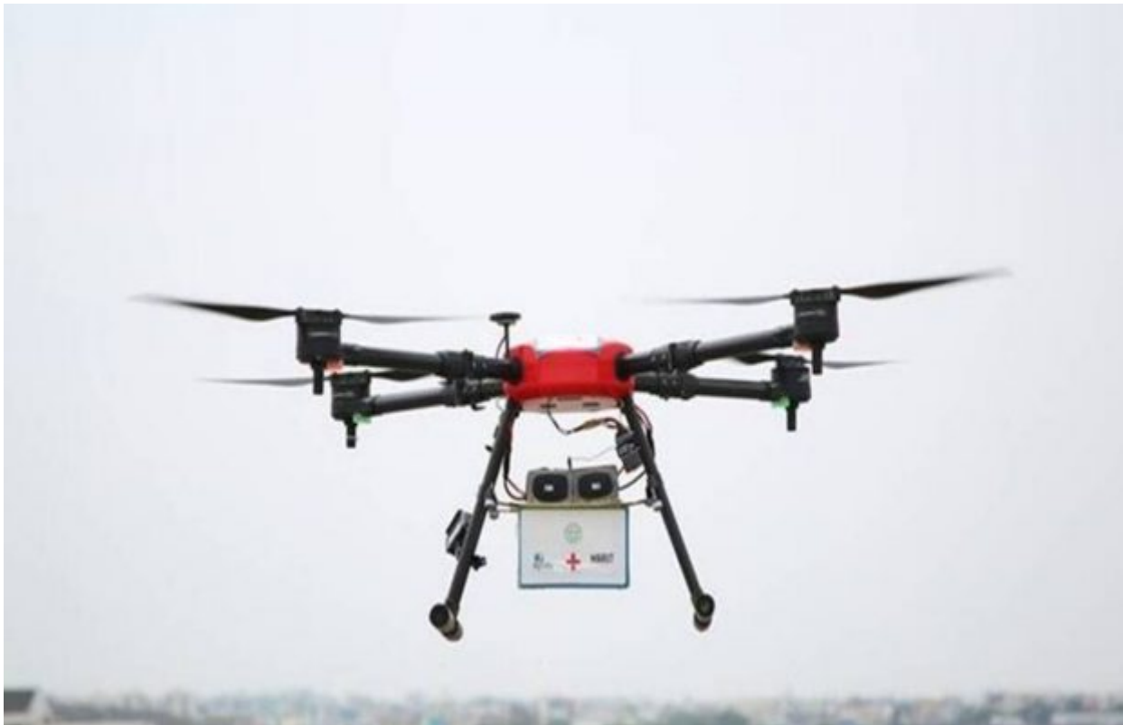
Drones to deliver vaccines, medical supplies to last mile. (representative Image)

Covid-19 vaccines will now reach remote areas through drones. Union Health minister Mansukh Mandaviya on Monday launched a new initiative as a part of its universal vaccine coverage to deliver jabs to tough and not so motorable terrains of North East India through drones.