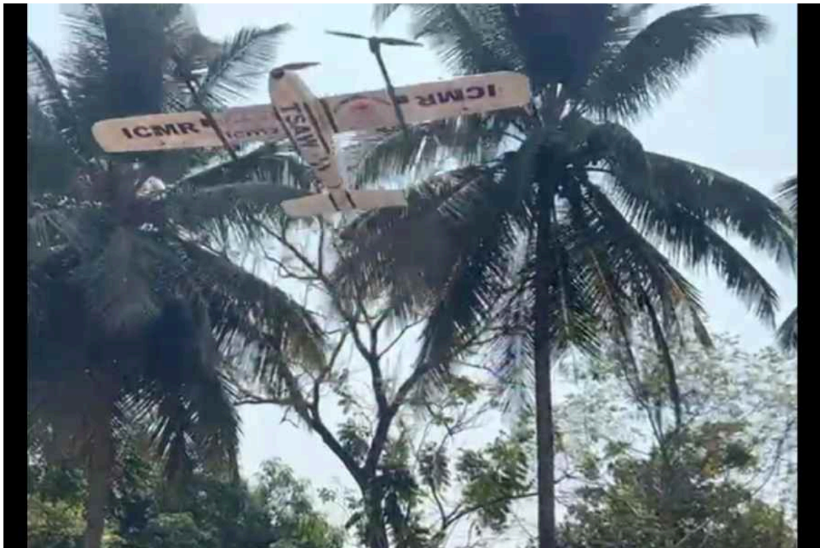
The ICMR drone which carried the tissue sample from the TMA Pai Rotary Hospital in Karkal to the Kasturba Medical College Hospital in Manipal.