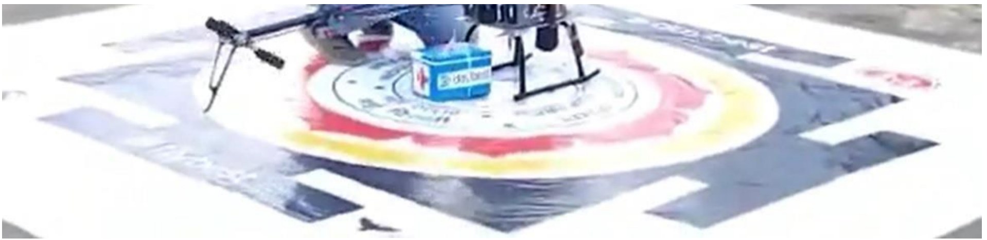
A screen shot of the video.

The ICMR's Drone Response and Outreach in North East (i-Drone), a delivery model to make sure that life-saving Covid vaccines reach everyone, is in line with the government's commitment to 'Antyodaya' in health - making healthcare accessible to the last citizen of the country, officials said.