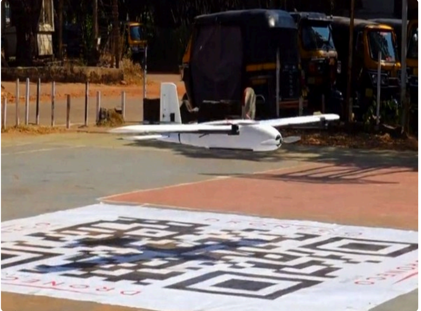
Visual of the drone that transported tissue sample under ICMR study