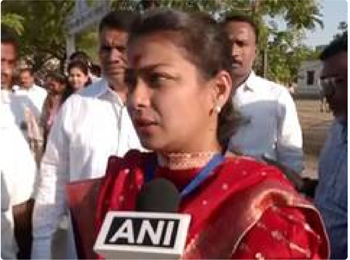
Former Maharashtra CM Sushil Kumar Shinde and his daughter Solapur Lok Sabha candidate Praniti Shinde cast their votes

(/news/national/politics/former-maharashtra-cm-sushil-kumar-shinde-and-his-daughter-solapur-lok-sabha-candidate-praniti-shinde-cast-their-votes20240507085938)